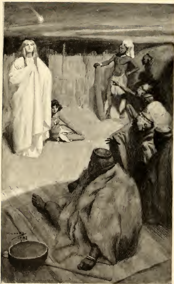
“ Such a star runs over before the death of kings ” (see page 137).